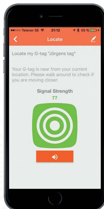
Clear symbol shows whether your G-tag is nearby