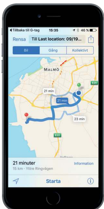
The map shows how you moved from your G-tag

NEW app update provides the user with new features to help search for lost objects.