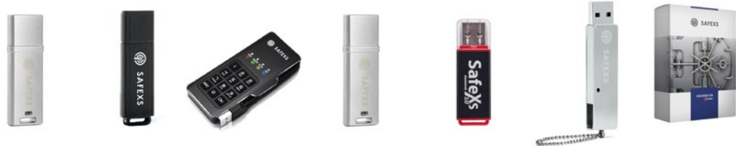
Data Protection Tool Protector XT Protector 3.0 Firebolt SSD Guardian XT Guardian 3.0 Guardian 2.0 Guardian Portable